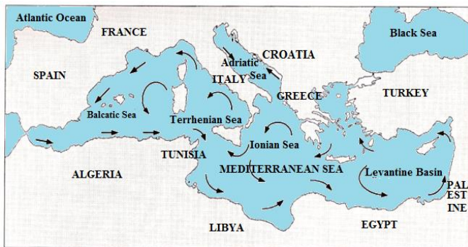
Figure 2. Generalized surface circulation pattern in topographic units of the MS (after Cimerman & Langer, 1991).