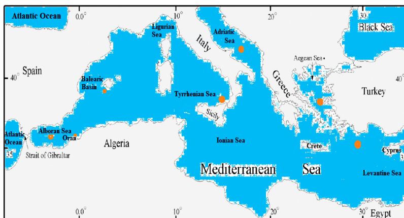
Figure 1. Location map of different localities in the studied coasts of western, central and eastern Mediterranean Sea (after: Cimerman & Langer, 1991; Abu-Zied et al, 2008; Milker & Schmiedl, 2012, with some modifications).

& Schmiedl, 2012) had been engaged in the paleontology and paleoenvironmental investigations of littoral benthic foraminiferal species of west, central and eastern Mediterranean Sea (Figure 1).